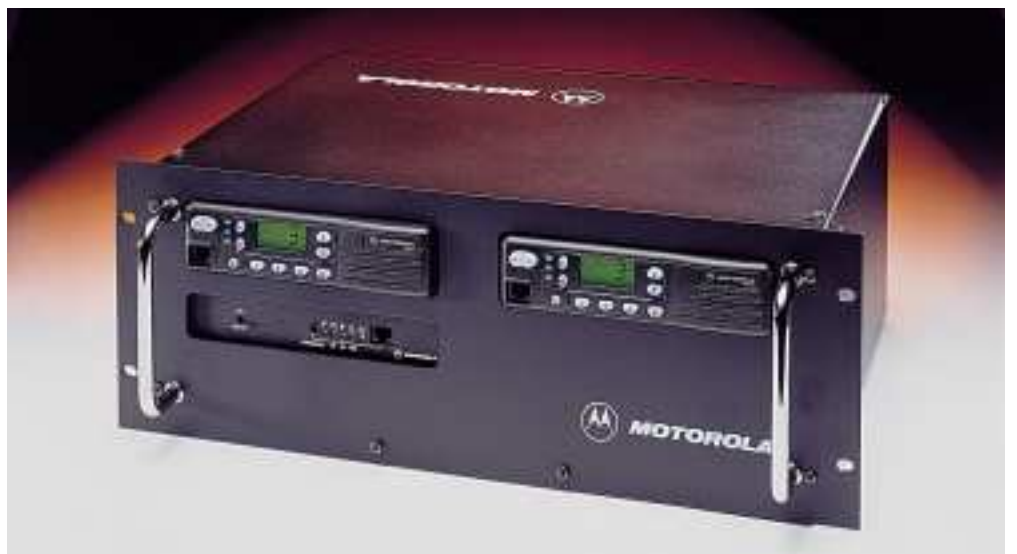
▲ The ENLN4058 conversion kit adapts the standard ENLN4055 to 19" (4U) rack mounting applications.