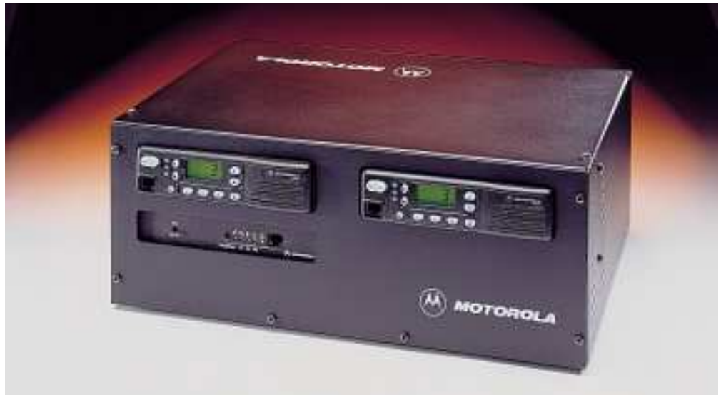
▲ The ENLN4057 conversion kit adapts the standard ENLN4055 housing to shelf or bench mounted applications.