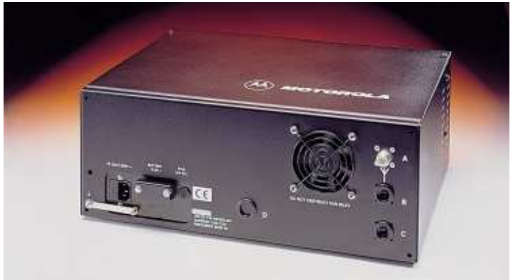
▲ The ENLN4055 standard wall-mount base station/repeater housing kit

"...versatility and flexibility supplied as standard..."